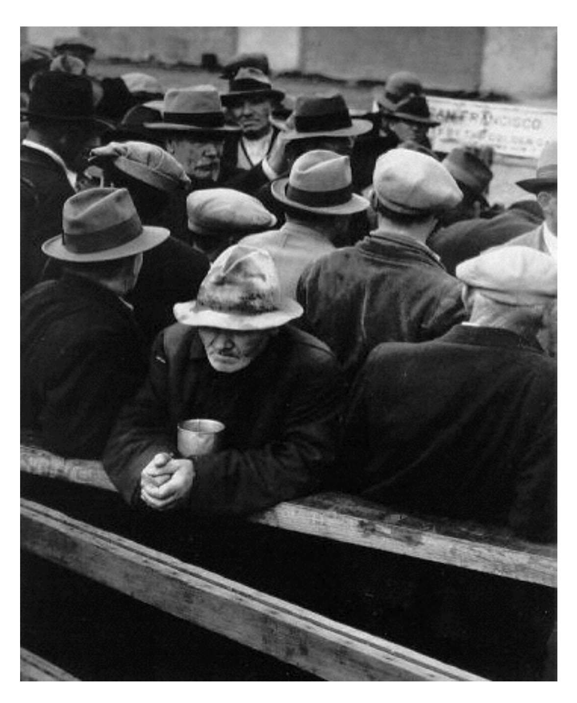
Approximately what type of shot is this?

Now what do you know about this man from the picture? About his environment?